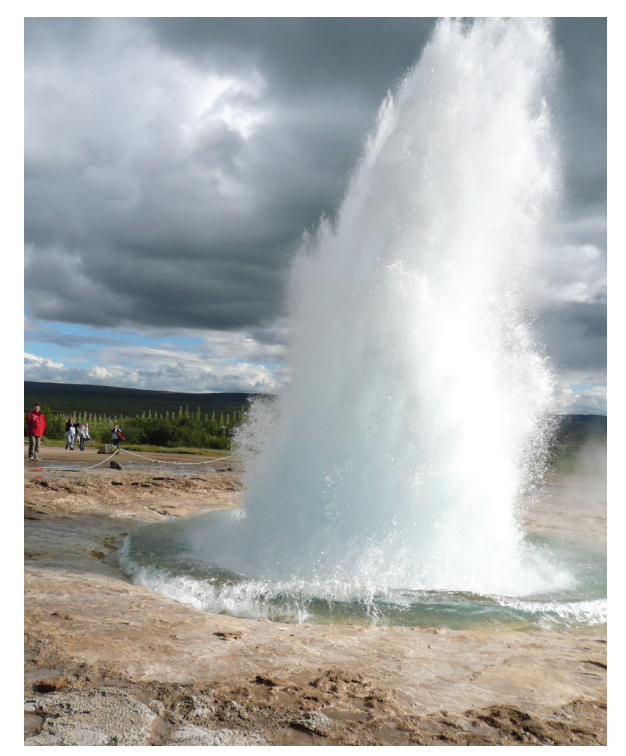
Strokkur Geyser in Iceland