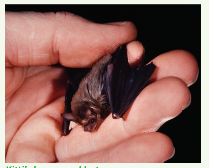
Kitti's hog-nosed bat

Some megabats are called flying foxes because of their fox-like faces and the red-coloured fur on their bodies. Although megabats hunt at night, large groups can often be seen during the day hanging from tall trees.