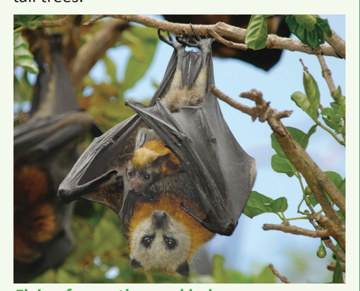
Flying fox mother and baby